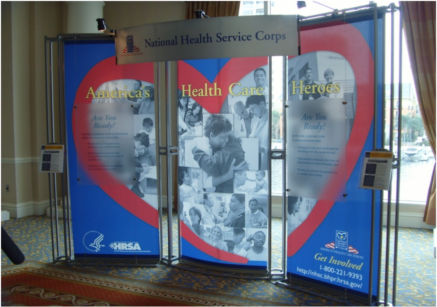
Exhibit Display- AFTER